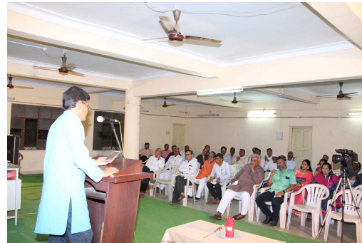
The recital of gazals by eminent and renowned poets .... and the busy audience....