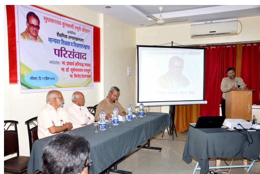
The Secretary addressing the meeting