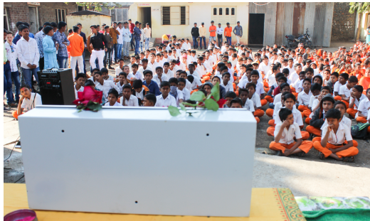
Students of Tirupati Vidyalaya, Pangaon during the function