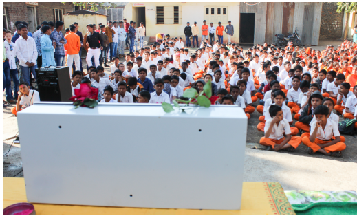
Students of Tirupati Vidyalaya, Pangaon during the function